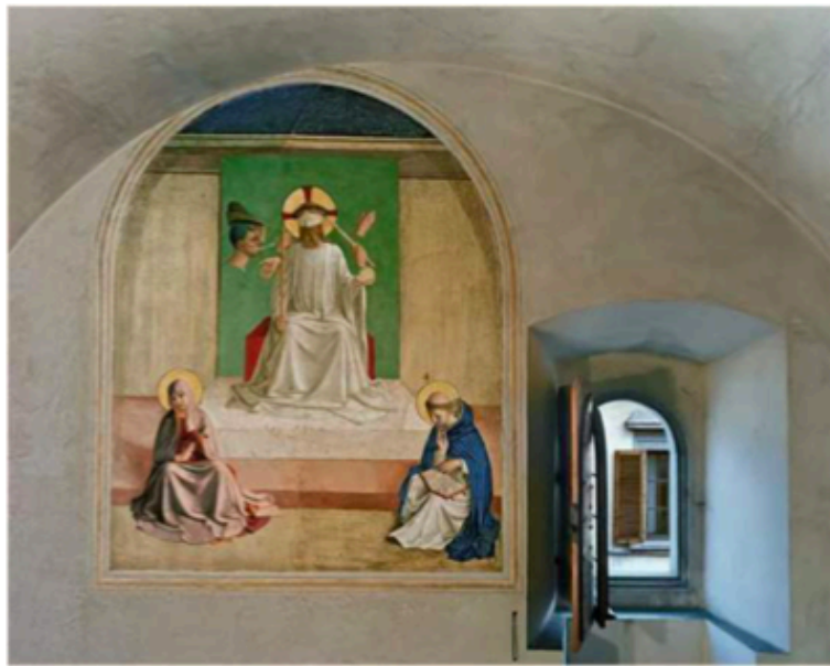
'The Mocking of Christ by Fra Angelico, Cell 7, Museum of San, Marco Convent, Florence, Italy' (2010)