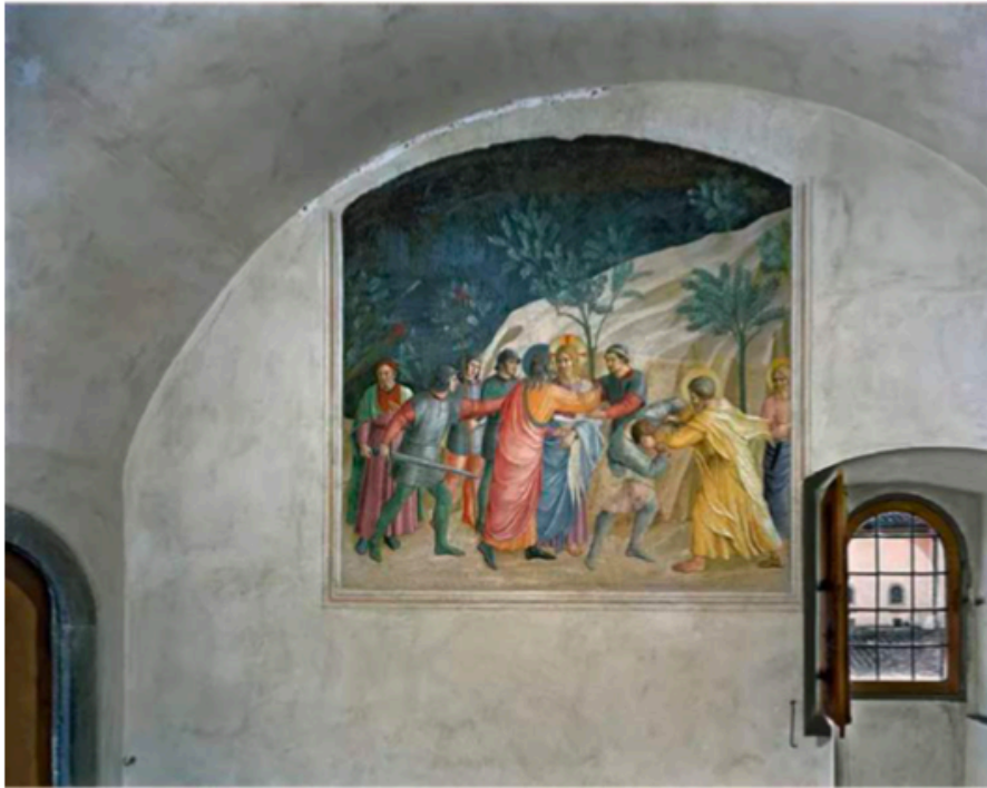
'The Capture of Christ by Fra Angelico, Cell 33, Museum of San Marco Convent, Florence, Italy' (2010)

Born in 1951, the Canadian-American photographer Robert Polidori is known for his large-scale colour images of architecture, urban environments and interior spaces. For a 2010 series, he was invited to photograph the frescoes of Italian Renaissance painter and Dominican friar Fra Angelico (1395-1455) that decorate the dormitories in the Convento di San Marco in Florence. Commissioned by Cosimo de Medici, the devotional works — depicting scenes from the life of Christ — were made to enhance meditation and prayer. Polidori's photographs show how the echoes of history resonate in architecture. His contemplative images also illuminate how interior spaces act as boundless containers for memory and emotion.