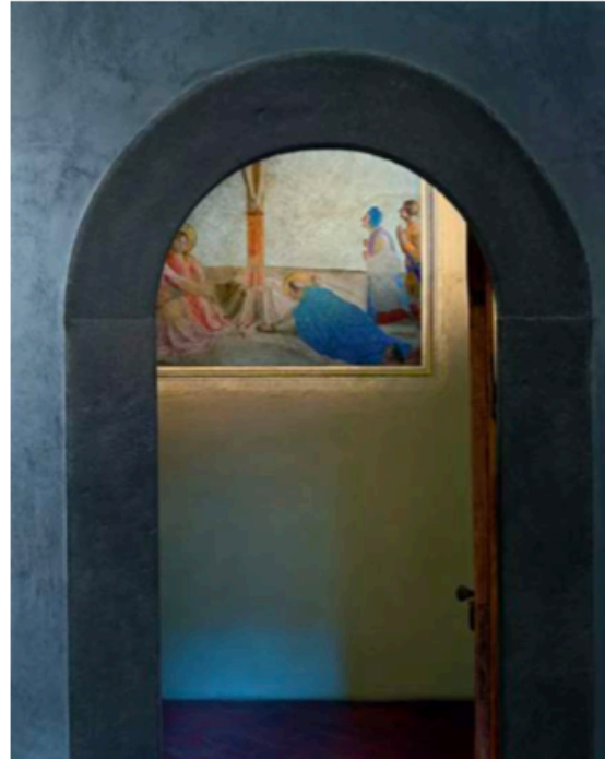
'Crucifixion with Saint Dominic prostrate on the floor, by Fra Angelico, Museum of San Marco Convent, Florence, Italy' (2010)