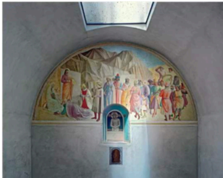
'Adoration of the Magi and Man of Sorrows by Fra Angelico, Cell 3g, Museum of San Marco Convent, Florence, Italy' (2010)